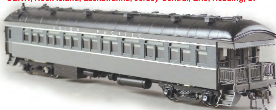
60' BUSINESS OBSERVATION

SP Green / Two Tone Grey, UP Two Tone Grey / Yellow, IC, CB&Q C&NW, Rock Island, Lackawanna, Jersey Central, Erie, Reading, SF